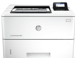
HP LaserJet Enterprise M506dn