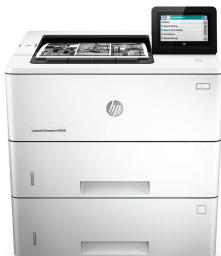
HP LaserJet Enterprise M506x