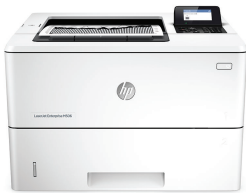
HP LaserJet Enterprise M506n

Finish tasks faster with a printer that starts right away and helps conserve energy. 1 Multi-level device security helps protect from threats. 2 Original HP Toner cartridges with JetIntelligence and this printer produce more high-quality pages. 2