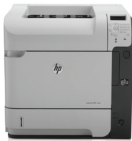
HP LaserJet Enterprise 600 Printer M602dn