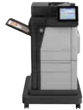
HP Color LaserJet Enterprise MFP M680f