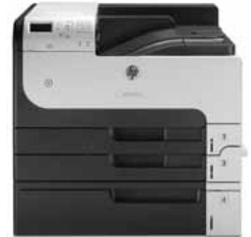
(HP LaserJet Enterprise 700 Printer M712xh)

Mobile printing capability: HP ePrint, Apple AirPrint™