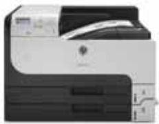
(HP LaserJet Enterprise 700 Printer M712n)