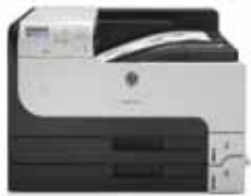
(HP LaserJet Enterprise 700 Printer M712dn)