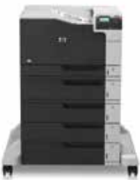
HP Color LaserJet Enterprise M750dn