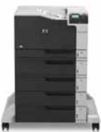
HP Color LaserJet Enterprise M750xh